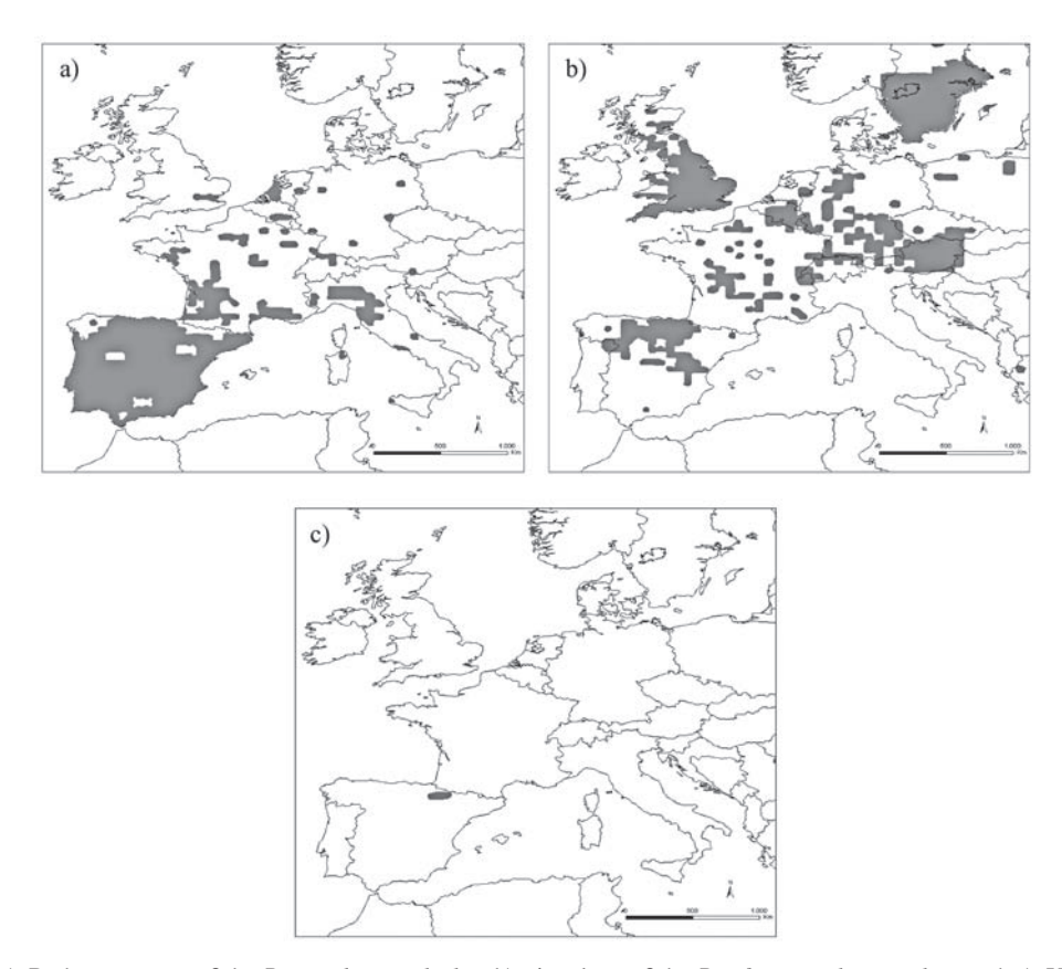
Figure 2. a) Red swamp crayfish, Procambarus clarkii , b) signal crayfish, Pacifastacus leniusculus , and c) Yabbie, Cherax destructor distribution range in Europe. The signal crayfish distribution range in Norway, Slovakia, Croatia, Estonia and Denmark is not represented on the map; ©Scientific publications MNHN, Paris, 2006 (modified from Holdich et al. 2009 for Procambarus clarkii and Pacifastacus leniusculus and from Souty-Grosset et al. 2006 for C. destructor ). a) Distribución del cangrejo rojo de las marismas Procambarus clarkii, b) cangrejo señal Pacifastacus leniusculus y c) Yabbie Cherax destructor en Europa. Para Pacifastacus leniusculus la distribución en Noruega, Eslovaquia, Croacia, Estonia y Dinamarca no está representada en el mapa © Publicaciones científicas MNHN, Paris, 2006 (modificado de Holdich et al. 2009 para Procambarus clarkii y Pacifastacus leniusculus y de Souty-Grosset et al. 2006 para C. destructor).

the bacterium that causes this serious infectious disease. This bacterium has been found in the stomach, hepatopancreas and water of P. clarkii , but not in its exoskeleton. These findings indicate that the red swamp crayfish is not a direct transmission vector of tularemia, and the most likely cause of this outbreak was the contamination of river water with animals killed by tularemia (lagomorphs), which then also infected P. clarkii .